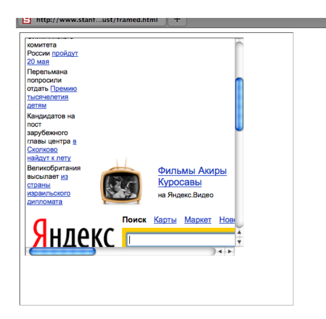
Figure 2: Double Framing Attack