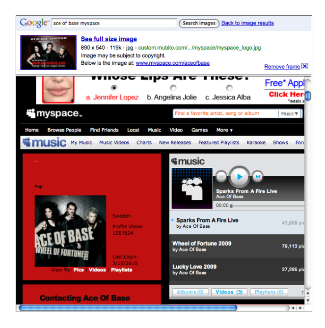
Figure 6: Because MySpace whitelists Google in the document referrer, an attacker's site can use Google Image search to launch clickjacking attacks on MySpace.

lem on the web is cross-site request forgery [2]. The web-key authentication scheme [6] uses unguessable secrets in URLs instead of cookies for authentication. This approach can mitigate confused deputy attacks such as clickjacking and CSRF. Experimental client-side defenses for clickjacking include ClearClick [18] and Click-IDS [1]. These defenses have not yet been widely deployed, so they cannot be relied upon by web sites as a primary defense. They also introduce some compatibility costs for legacy web sites, which may hinder browser vendor adoption.