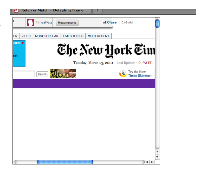
Figure 4: Result of referrer checking attack

It should be noted that the referrer header is not sent from a secure context (https) to non-secure context (http) and is frequently removed by proxies [2]. In the examples above a missing referrer can lead to the wrong