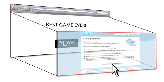
Figure 1: Visualization of a clickjacking attack on Twitter's account deletion page.

Frame busting refers to code or annotation provided by a web page intended to prevent the web page from being loaded in a sub-frame. Frame busting is the recommended defense against clickjacking [10] and is also required to secure image-based authentication such as the Sign-in Seal used by Yahoo. Sign-in Seal displays a user-selected image that authenticates the Yahoo! login page to the user. Without frame busting, the login page could be opened in a sub-frame so that the correct image is displayed to the user, even though the top page is not the real Yahoo login page. New advancements in clickjacking techniques [22] using drag-and-drop to extract and inject data into frames further demonstrate the importance of secure frame busting.